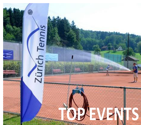
Illustration: Shutterstock images; Fotos: Kurt Schoner, Foto-net